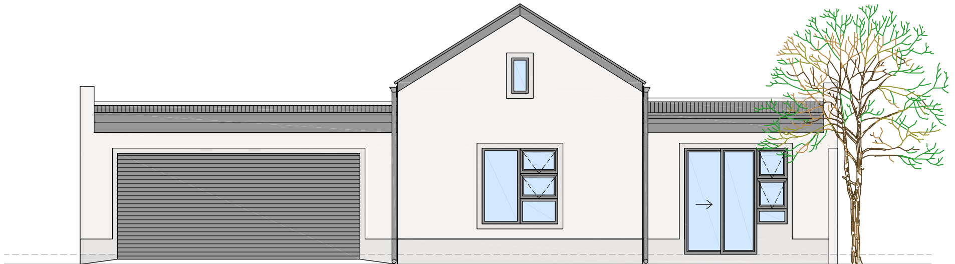
TYPICAL ELEVATION scale 1 : 75